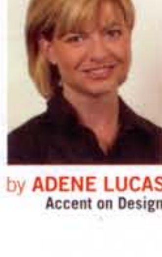
by ADENE LUCAS Accent on Design

When reminiscing about my childhood, I often think back to the yellow and brown room with orange carpet that I grew up with. The problem with bad decorating choices is the poor impression that is left. Sure there are countless other memories, but I still groan when I think of our old formica kitchen table with the vinyl seats trimmed in yellow piping. Enough said.